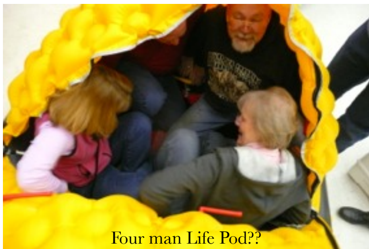
Four man Life Pod??